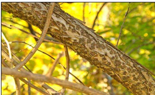
The bark of mature bittersweet has a characteristic raised netted pattern that makes it easy to identify.