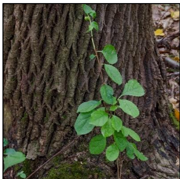
Asian bittersweet seedlings often get their start at the base of trees where birds have dropped the seeds.

Asiatic bittersweet grows as a twining or sprawling, many-branched, deciduous vine with woody stems. It can scale trees up to 60 feet high. Stems of old vines may resemble small trees; 4-inch diameter trunks are common and even larger ones are reported. The bark on the vine's trunks is light to medium tan or gray with a distinctive pattern of irregular netting. Small branches have tan or gray bark marked with small, whitish-gray bumps (lenticels), while the youngest branches are very slender with green or dark brown bark. Bark on the roots is bright orange. The bark and dormant leaf buds, which are oddly recessed into the stems and covered with a thorn-like bud scale, are helpful for winter identification.