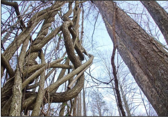
Massive Asiatic bittersweet vines, shown at left, have climbed high into the trees. The vines are more than 20 years old and their weight will soon topple the large, old trees they climb.