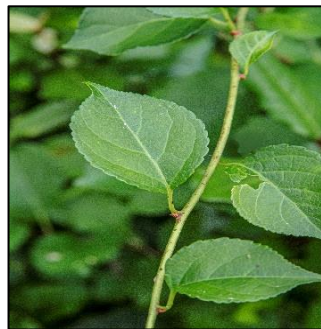
Left: Asiatic bittersweet is spread by birds and by people who use the fruits for decorations. Right: Leaves have toothed edges and are widely spaced around undulating stems. They may be pointed or not.