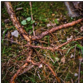
Roots are bright orange.

There are usually separate female (fruiting) and male (non-fruiting) plants. Clusters of small, pale green, 5-petaled flowers bloom in early summer in the leaf axils, but only female vines produce fruits. The fruits change in appearance from summer into winter, making positive identification tricky for the uninitiated. Fruits begin as clusters of round, green, 1/2-inch "berries" that ripen to golden-yellow. In fall, the golden outer covering splits open to