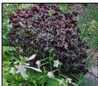
The purple-leaf variety of perilla mint is favored by gardeners as a splash of colorful foliage. If you must plant it, always remove all flower spikes before they set seed.

Which plants you grow around your home or are planted in commercial settings matters in ways most people cannot begin to imagine. Many of the worst nonnative, invasive plants plaguing our natural and agricultural areas began their careers in home gardens or landscape settings. Some were – and most still are – sold and promoted for their showy beauty, fast growth, or bird- or butterfly-attracting attributes. Easy to grow and satisfying to look at, these innocent-seeming plants aren't content to remain where planted. They escape their garden settings, multiply, and cavort where they were never meant to be. In the process, once "introduced" into the natural landscape, they displace native plants that are the basis for the food chains that sustain the natural kingdom.