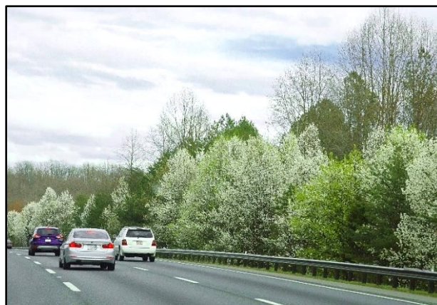
Nonnative ornamental pear trees now occur as weed trees up and down the roadsides in the Mid-Atlantic States, having escaped from nearby suburban yards and shopping malls.

Perilla mint, also called beefsteak plant, ( Perilla frutescens ) is a good example of an introduced garden plant gone badly wild. Valued both as a medicinal herb, salad green, and showy foliage plant, this mint family annual probably escaped from gardens many times and in many places. Now it grows aggressively where it is not wanted in floodplains, forests, hayfields and pastures where it can form dense monotypic stands. It is toxic to livestock if they eat it fresh, less so in hay. Ingested by cattle, the herb causes severe respiratory distress called panting disease . This medicinal plant has spread aggressively throughout the eastern US, especially in the Mid-Atlantic and South. Naturalized stands of perilla crowd out native plants that are food for wildlife. This destruction began innocently by people planting something