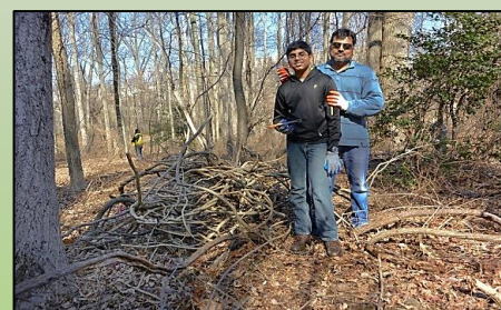
A father and son teamed up on a winter invasive volunteer workday at a neighborhood park. They cut large Oriental bittersweet vines at head height and ground level to create a "window" in the hanging vines. In spring, a contractor will treat the leaves that resprout with herbicide.

Using manual or mechanical methods to reduce the mass of an invasive plant's foliage before spraying it with herbicide is one way to limit the amount of herbicide you use, while still effectively dispatching the invasive plants. This method also reduces possible collateral damage to nearby desirable plants, because the area treated with herbicides will be smaller.