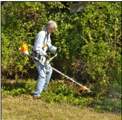
A weed-whacker fitted with a steel blade cuts through stout Japanese honeysuckle vines climbing small trees.

Weed-whackers with string trimmers can be used to cut herbaceous invasive plants to the ground. Woody shrubs and vines require a steel blade on the trimmer. Weed-whacking, however, may