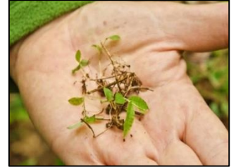
Removing even the tiny seedlings of wavyleaf grass, an invasive perennial, is necessary to stop it from spreading.

If the pulled plants are not in flower or have not yet set seeds, you can leave them on the ground. However, if they have set seeds, then put them directly into a plastic bag and dispose of them in a landfill, otherwise the seeds will fall to the ground and continue the infestation. If flowering, some invasives such as garlic mustard, continue to set seeds after being hand-pulled. It is best to not