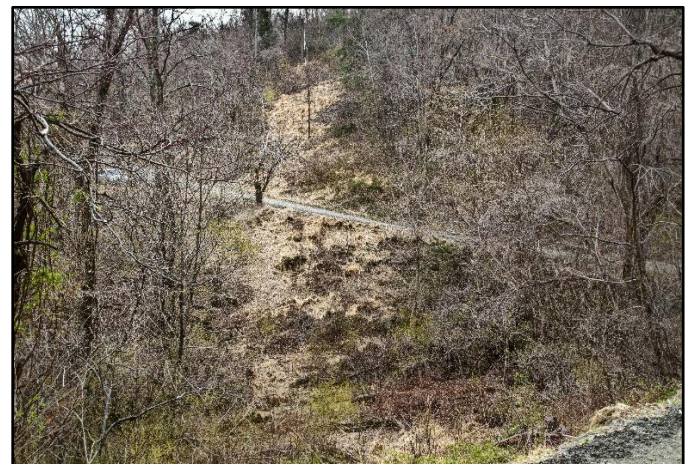
Japanese stiltgrass grows tall and thick in the sun and moisture of this powerline cut. When it turns dry and straw colored in winter, the mat of dried grass poses a fire hazard. It can burn so hot that it increases the likelihood of destructive canopy fires.

Surface water washes stiltgrass seed downhill to be deposited for later germination. Wild and domestic animals, humans, and vehicles spread seed-laden soil as they move along roads and trails or open land, carrying this nasty plant in all directions. Where deer are overpopulated, stiltgrass wins the competition because deer decimate native plants, making it easy for stiltgrass to spread unchecked where native plants are struggling. As if all these wily ways are not enough, stiltgrass releases chemicals that change soil chemistry and effectively stop other plants from growing, which allows the invader to spread quickly.