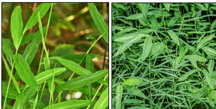
Left: Stiltgrass leaves have a faint white striped midvein off center in the middle of the leaf blade. Right: Japanese stiltgrass is the grass with the bolder texture; Virginia whitegrass, a native, is the finer-textured grass.

Slender and wiry, Japanese stiltgrass grows 6 inches to 4 feet tall, depending upon growing conditions. Tall plants branch at the nodes and may flop and root at stem joints at the end of the growing season. Leaf blades are flat, 2 to 4 inches long, lance-shaped to slightly oblong, and alternate along the stem. Leaves usually have a faint silvery main vein, which some say resembles a slug trail; it divides the leaf into two slightly unequal parts. The base of the leaf forms a sheath that clasps the stem. If you run your fingers along a stiltgrass stem, it feels smooth. If you gently tug on the grass, it pulls easily from the ground, displaying slender, branched roots that resemble stilts. In winter, the grass turns strawlike and forms thick mats of dry stems, making it highly visible during the dormant season.