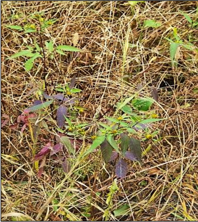
A grass-specific herbicide was used here to kill Japanese stiltgrass, a highly aggressive invasive grass, while leaving the broadleaf, flowering plants unharmed.

Some herbicides are prominently labeled “Restricted Use” because they are more hazardous if not used correctly. These may only be applied by someone who is a “certified applicator” and who earned that certification by studying and passing a test. Products that are not “restricted” are “general use” and may be applied by anyone on their own property or by anyone working for the landowner. All herbicides commonly used to control invasive plants are general use and can be applied by anyone on their own property.