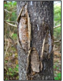
Fungal disease on tree-of-heaven.

In developing a biocontrol agent, scientists study what keeps an invasive plant in check in its native territory and then try to isolate the insect or disease, grow it in a laboratory, and test it to see if it is safe to unleash in the environment. This may require five or more years of rigorous testing. Often an agent under study falls short in one or more of the above-listed criteria. Because numerous natural enemies, such as caterpillars, beetles, and fungal diseases, are interdependent upon a host plant, releasing only one biocontrol agent may not keep the plant in check compared to what happens in the plant's native environment. Despite the fact that all invasive plants have natural enemies that feed on and thus regulate them where they natu-