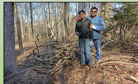
A father and son teamed up on a winter invasive volunteer workday at a neighborhood park. They cut large Asiatic bittersweet vines at head height and ground level to create a "window" in the hanging vines. In spring, a contractor will treat the leaves that resprout with herbicide.

Using manual or mechanical methods to reduce the mass of an invasive plant's foliage before spraying it with herbicide is one way to limit the amount of herbicide you use, while still effectively dispatching the invasive plants. This method also reduces possible collateral damage to nearby desirable plants, because the area treated with herbicides will be smaller.