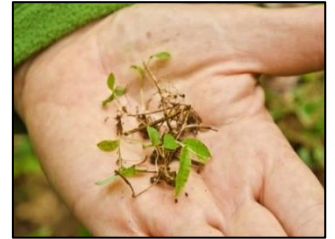
Removing even the tiny seedlings of wavyleaf grass, an invasive perennial, is necessary to stop it from spreading.

If the pulled plants are not in flower or have not yet set seeds, you can leave them on the ground. However, if they have set seeds, then put them directly into a plastic bag and dispose of them in a landfill, otherwise the seeds will fall to the ground and continue the infestation. If flowering, some invasives such as garlic mustard, continue to set seeds after being hand-pulled. It is best to not