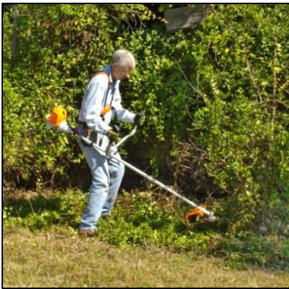
A weed-whacker fitted with a steel blade cuts through stout Japanese honeysuckle vines climbing small trees.

Weed-whackers with string trimmers can be used to cut herbaceous invasive plants to the ground. Woody shrubs and vines require a steel blade on the trimmer. Weed-whacking, however, may