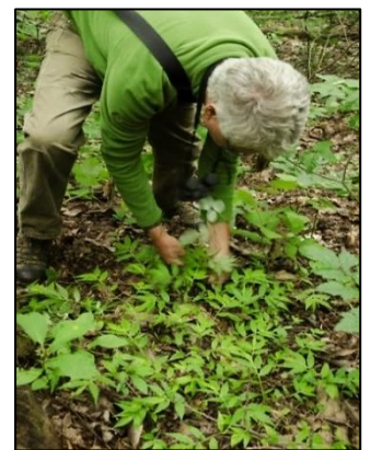
When hand-pulling a perennial such as wavyleaf grass, shown here, all the roots must be removed or the plant will regrow.